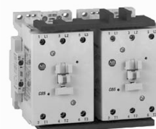
Cat. No. 104-C85D22