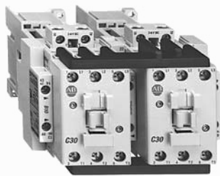
Cat. No. 104-C30ZJ22