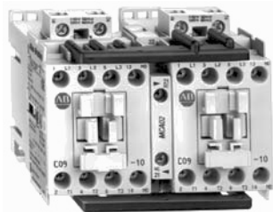
Cat. No. 104-C09D22